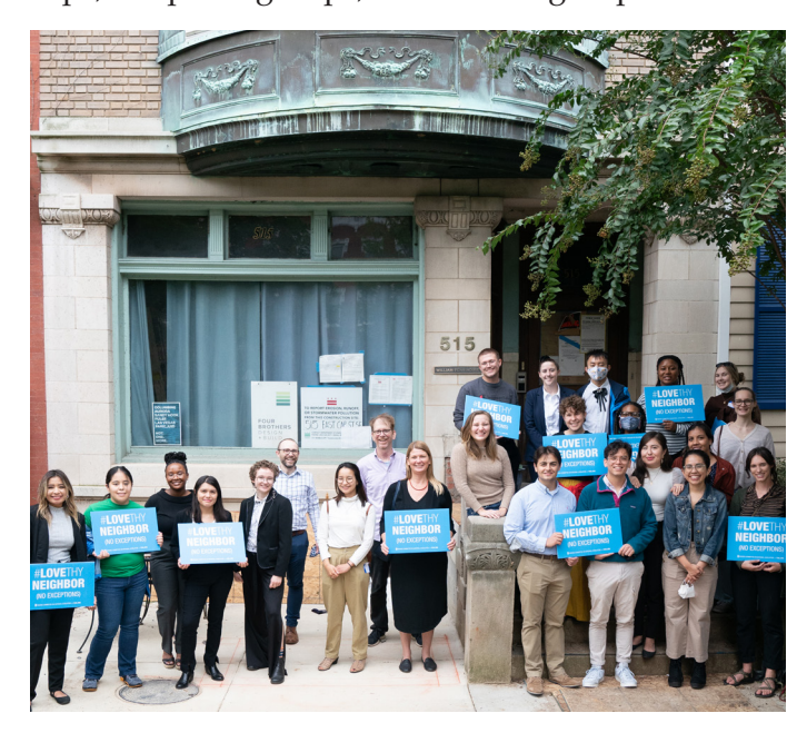
In October, FCNL welcomed its first group of Advocacy Corps organizers back to Washington, D.C., since the pandemic began. They had an opportunity to visit the soon-to-open Friends Place on Capitol Hill.

Already, Friends Place has 35 visiting groups on the calendar for 2022, totaling more than 600 people. Most groups will fall into four categories: junior and senior high school groups, college service-learning trips, nonprofit groups, and activist groups.